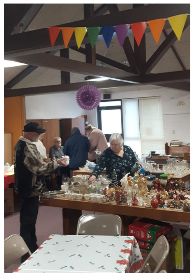
Members of the Trinity family set up for the latest Christmas Bazaar. The event was another success.