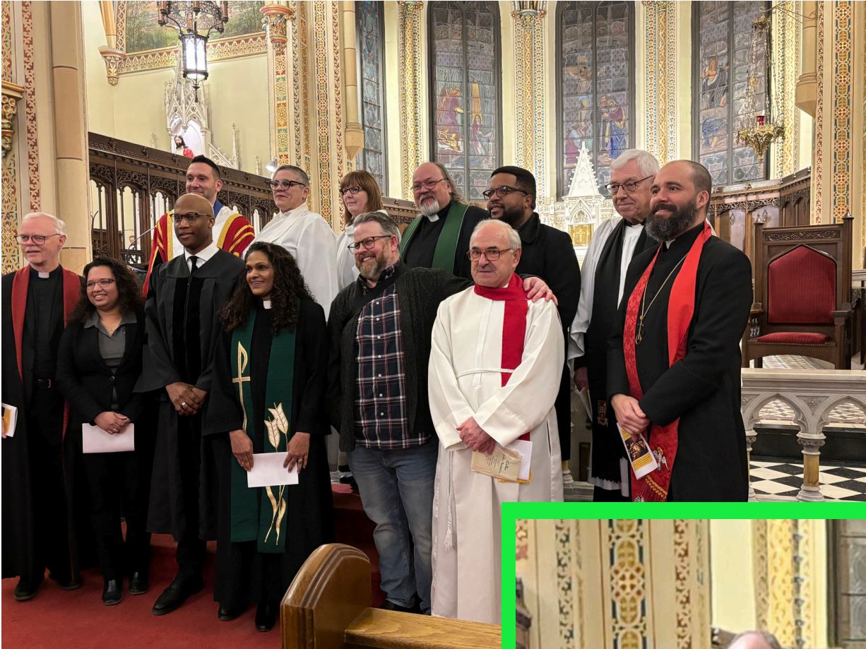
Trinity was invited to join eight other denominations and local ministries in an evening prayer service at Our Lady of the Assumption church on Jan. 21. It was a service of music and prayer intended to foster unity among the congregations. Participants also heard the Lord's Prayer offered in Aramaic.